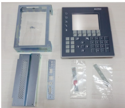
Short-stroke keyboard with accessories

Rieter offers a refurbishment of the PP 450 operating unit with a repair kit. It consists of an industrial grade short-stroke keyboard, a dust-proof assembly.